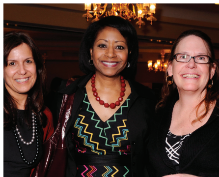
Harford Night in Annapolis